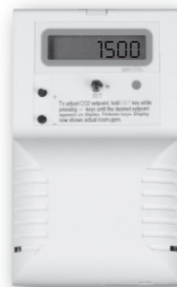
Optional CO 2 -400 CO 2 controller

CO 2 (carbon dioxide) is needed by plants for proper growth. In an indoor environment it is quickly depleted, which slows or even stops growth. CO 2 can be added by either a cylinder of CO 2 or by burning cheaper and easier to obtain propane or natural gas. Under ideal combustion, only CO 2 and water vapor are produced. A furnace burns gas, uses the heat, and discards the combustion gases. A CO 2 generator generally does the opposite - it uses the combustion gases (CO 2 ) and discards or redirects the heat. A furnace is optimized for maximum heat, a CO 2 generator for cleanest CO 2 . CO 2 generators are best suited for larger grow rooms with temperature and humidity under good control. The Gas Pro is designed to be controlled by a timer or CO 2 controller. It is not designed for continuous operation.